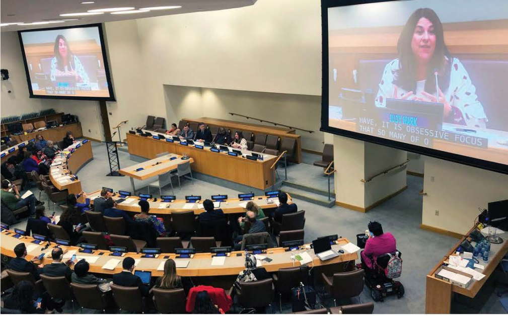
World Autism Day at the U.N., April 2, 2019