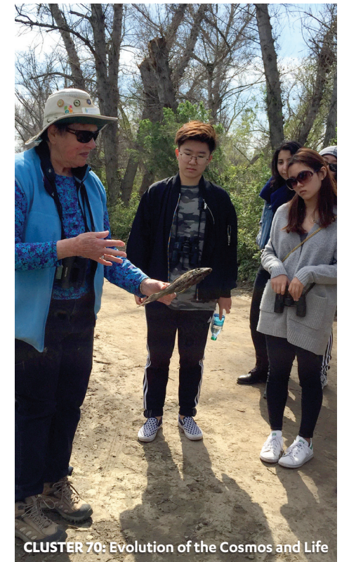
CLUSTER 70: Evolution of the Cosmos and Life

Go beyond hippies, tie-dye and Motown to examine the major social revolutions of the 1960s that transformed America's cultural character and political environment forever. Explore the '60s counter-culture, turbulent political arena and revolutionary youth movements while making connections to society today.